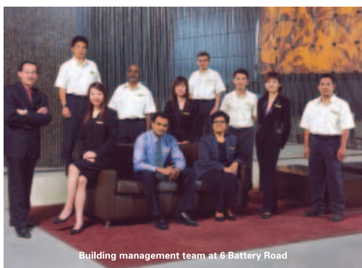
Building management team at 6 Battery Road

>> The building, which offers panoramic views of the Singapore River and Marina Bay, has an NLA of 45,910 sq m. Of the 79 tenants located there, key prominent ones include Standard Chartered Bank and Nomura Singapore Limited.